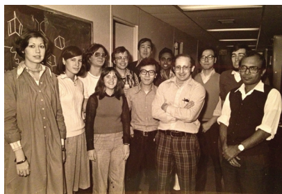
The Turro group in the mid-1970s.