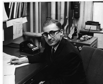
Nicholas J. Turro in the 1960s.

and unquenchable energy for science was a true inspiration. He never seemed to run out of ideas for experiments to tackle in new research projects, and was always pushing for the reading of the scientific literature before starting experiments."