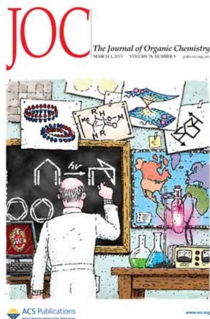
Cover, Journal of Organic Chemistry , March 2, 2012. Reproduced with permission from the Journal of Organic Chemistry , March 1, 2013, 78(5) cover. Published 2013 American Chemical Society.